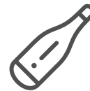
Risk based Analysis